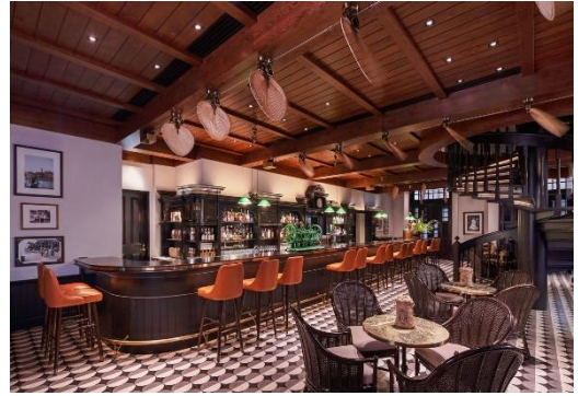
Long Bar, Raffles Hotel Singapore