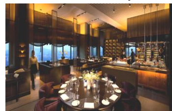
37 Grill & Bar Conrad Hotel Seoul