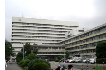
“Paying high educational expenses is wrong ( Akan ).”