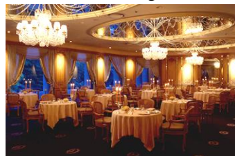
La Tour d'Argent Tokyo