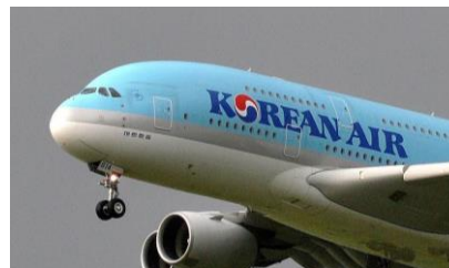
“Something was wrong.”

A doctor of Seoul National University said “It is an honor to fail the examination for the medical faculty than pass the other faculties of our Seoul University” at the Seoul National University Hospital about more than 30 years ago. In Japan, it is an honor to pass the entrance examination to test scholastic ability for a national university because only brilliant candidates can pass it. As for me, it is an honor to have passed an examination to test scholastic ability for Fukushima University (public university, Japan) on March 15, 1984. On the other hand, it is shame to have costed about forty million yen to pass the Japanese national examination for medical practitioners at Aichi Medical University (private backdoor university, Japan) on May 7, 1986. One of the partner institutions of Seoul National University, Keio University (Tokyo) is a private, money-powered backdoor university, too. Many doctors who are graduates of Keio University spent the same amount of money as I did is a shame ( Hazukashii ) and some doctors who are graduates of Keio payed the backdoor fees (sixty million yen) are terrible ( Hidoi ) in Japan.