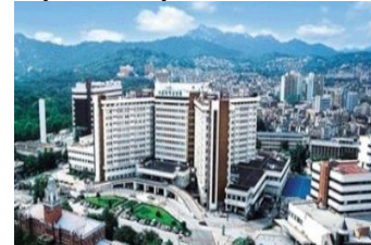
Seoul National University