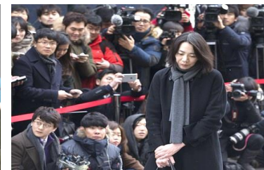
(Former)Vice-President Heather Cho Korean Air