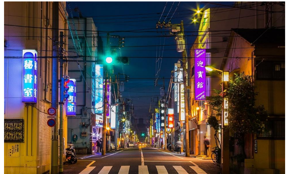
Yoshiwara in Tokyo