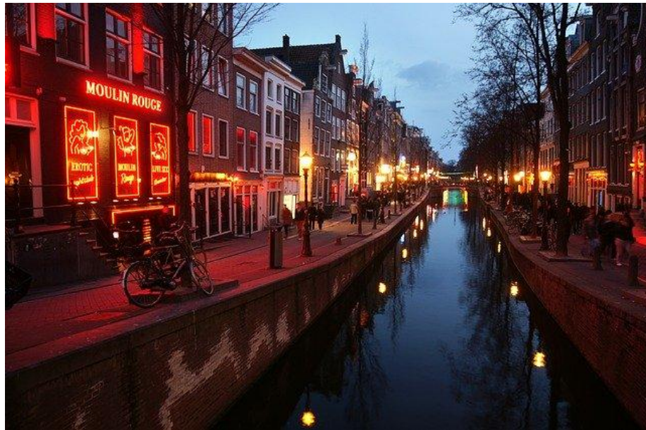
Red Light District in Amsterdam

Just as the 21st-century "Yoshiwara" remains a distinct locale where the official stance ( tatemae ) and underlying reality are profoundly disconnected, the fact that opaque deals involving sexual favors and data fabrication were left unchecked behind the "sanctuary" of a chief professorship is an extremely grave matter. Regarding this issue, Yohei Matsumoto, the Minister of Education, Culture, Sports, Science and Technology, described the situation as "outrageous and deeply regrettable." However, concerning the ongoing review for the "Universities for International Research Excellence" initiative, he indicated a judgment that "it will not lead to an immediate termination of the screening process." This case illustrates how the "inward-looking logic" commonly found in Japanese organizations and excessive deference ( sontaku ) toward those in authority can paralyze objective ethics. It stands as a poignant and unavoidable lesson for Japan as it strives to secure true internationalization and institutional transparency.