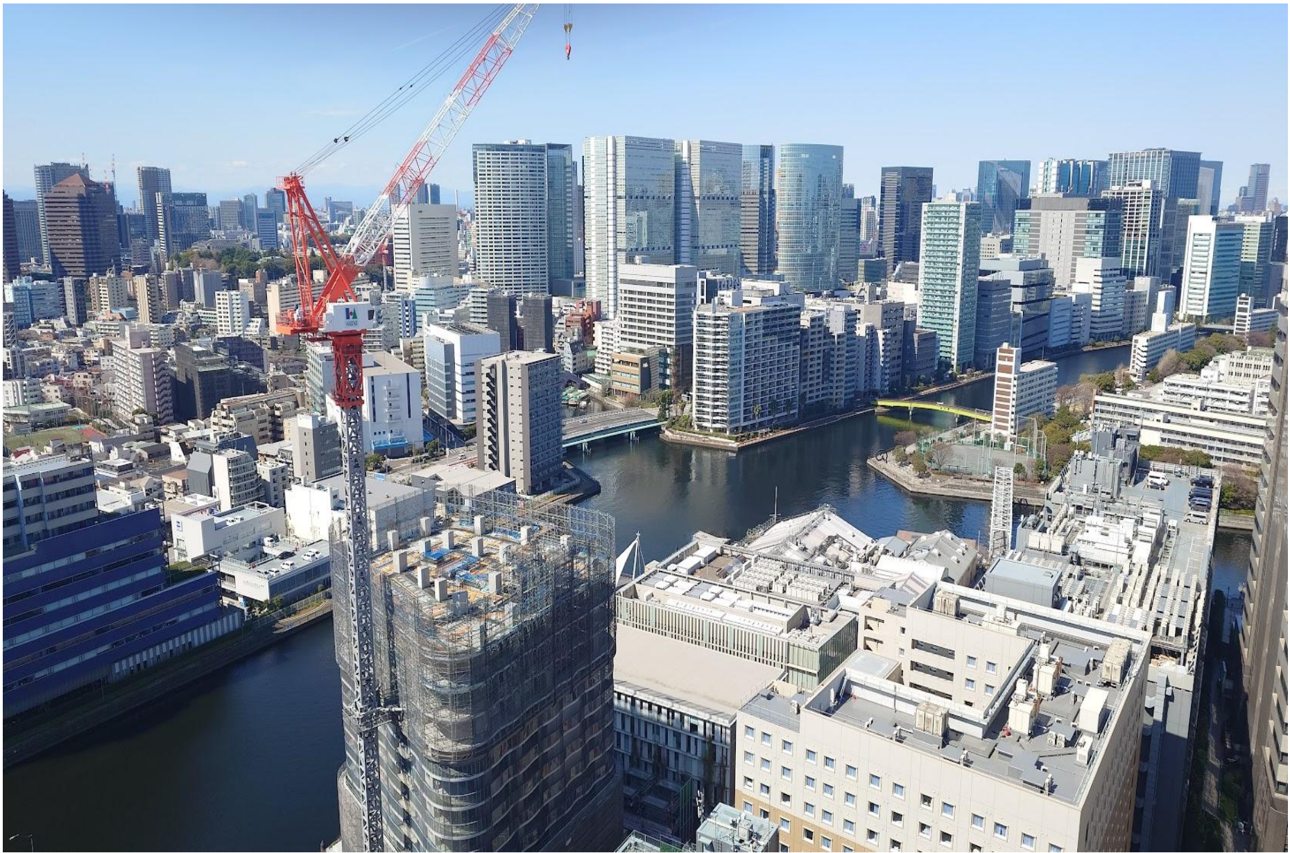
A view of Shinagawa Station looking toward central Tokyo, taken from my 31st-floor residence in a high-rise apartment, Shinagawa-ku, Tokyo on March 15, 2026.