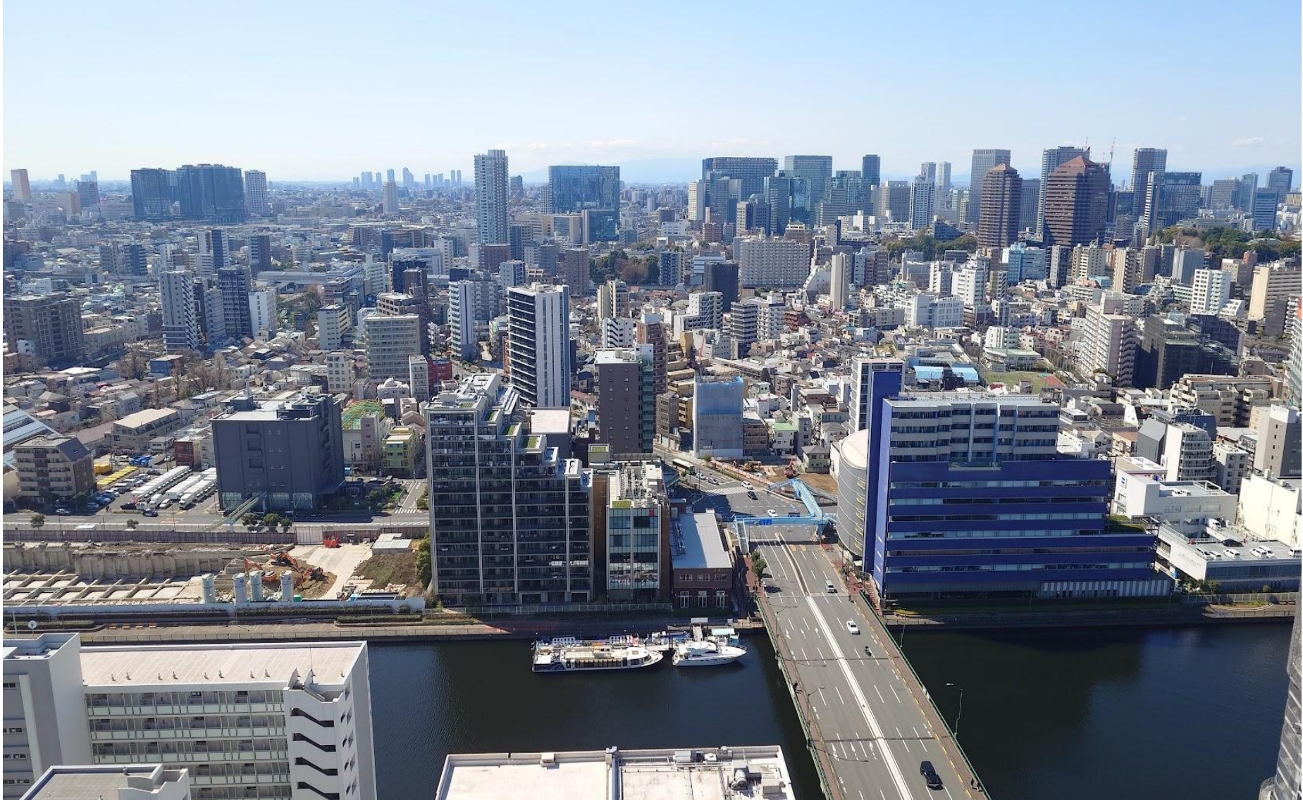
A view of southern Tokyo from my 31st-floor residence in Shinagawa-ku, taken on March 15, 2026. While not captured here, Mt. Fuji is visible straight ahead on clearer days

I will take a business trip to Berlin and Amsterdam from May 2 to May 8, 2026, and will stay at the Hotel Adlon Kempinski Berlin on May 2 and 3, the Mandarin Oriental Amsterdam on May 5, and the Waldorf Astoria Amsterdam on May 6. Amsterdam is well-known for the Anne Frank House, Rembrandt’s “The Night Watch,” its canals, and the Red Light District. About 40 years ago, I visited all these sites while staying at the Hotel Okura Amsterdam, which was recommended to me by the tourist information office in front of Amsterdam Station. Even in Tokyo, many canals remain from the Edo period (1600–1868); in fact, there is a canal right in front of my current residence.