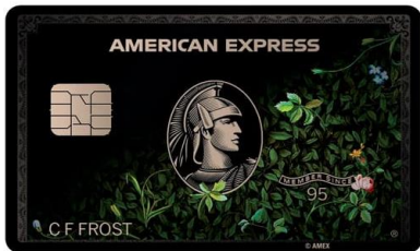
AMEX Centurion Card