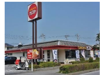
Family Restaurant “Gusto”