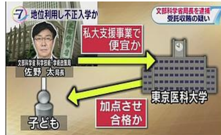
“Adding unauthorized points to the son of the Senior official of the MEXT”