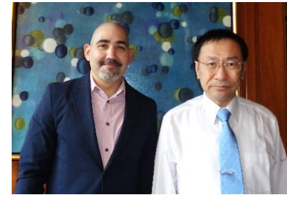
Restaurant Manager Four Seasons Hotel San Francisco