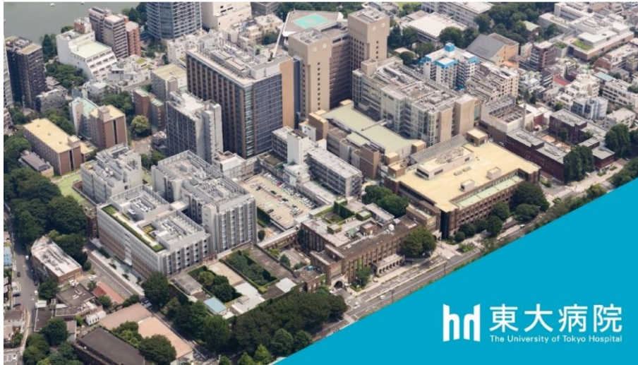
The University of Tokyo Hospital in the University of Tokyo Campus