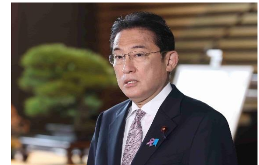
Japanese Prime Minister Fumio KISHIDA