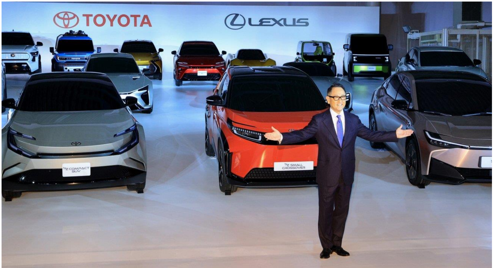
“Keio Boy ( Obocchan ) with wealthy parents is an ingenious youth.” TOYOTA CM with President Akio TOYODA