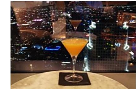
Cocktail “Chairperson” InterContinental Hotel Los Angeles