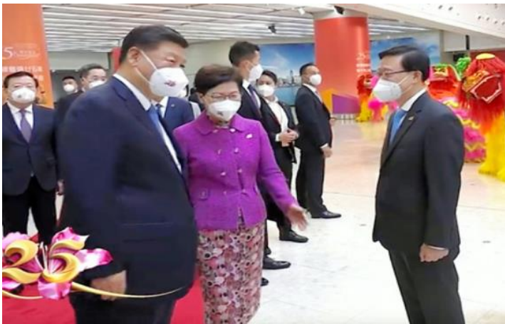
President of the People's Republic of China and General Secretary of the Chinese Communist Party 习近平 XI Jinping The 4th Chief Executive of Hong Kong 林鄭月娥 Carrie Lam Cheng Yuet-ngor The 5th Chief Executive of Hong Kong 李家超 John LEE Ka-chiu