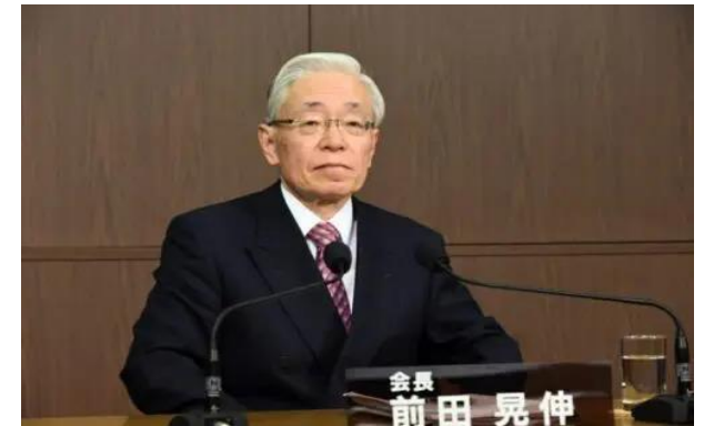
“Foolish ( Ahokusai )”