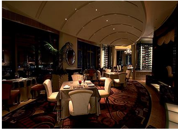
French Restaurant "mal D'amour" and Chef Kimitaka NIIMURA