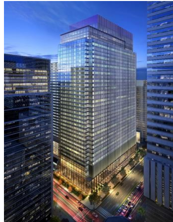
Four Seasons Hotel Otemachi, Tokyo (34F ~39F)