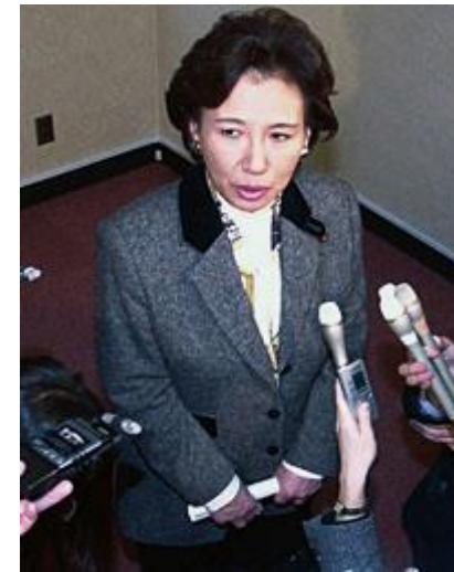
She and Prime Minister Fumio KISHIDA are graduates of private WASEDA University. Former Foreign Minister Makiko TANAKA