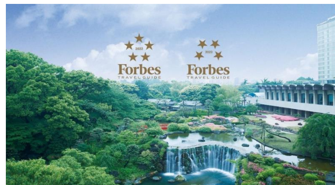
Hotel New Otani Tokyo