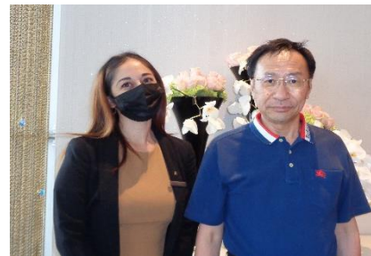
Rooms Operations Manager Ritz-Carlton Hotel Los Angeles