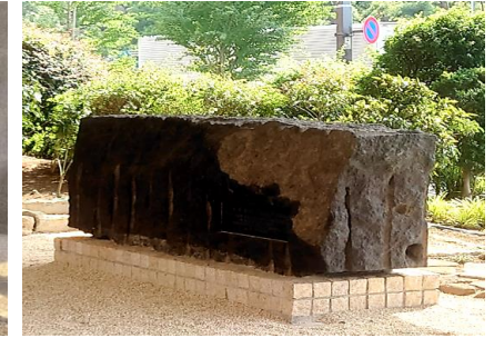
Front: Dirty stone Back: Ragged stone A big rectangular stone with letters of “Imperial Hotel” at the hotel main entrance

“The Imperial Hotel Tokyo since 1890 will reopen its new building in 2036. However, transferring the hotel workers correctly may be an urgent necessity in 2022. Foreign-affiliated top-class hotels opened one after another in Tokyo in the 21st century. The Imperial Hotel has been sinking both in terms of software and hardware relatively.”