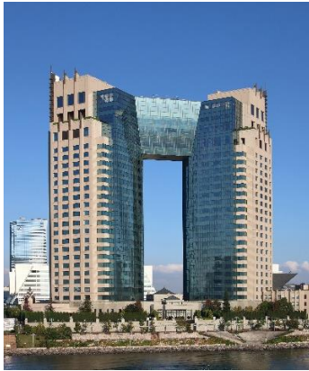
Tokyo Baycourt Club (Member's Hotel)