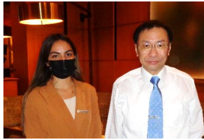
Front Office Assistant Manager

General Manager Ritz-Carlton Los Angeles Los Angeles, USA