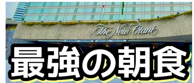
Hotel’s PR “Strongest (Ultimate) Breakfast”