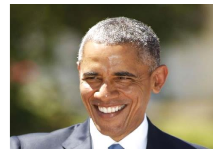
Former US President Barack OBAMA

There is an old saying in Japan “We also want to get the help of a cat” which means “We’ll take all the help we can get.” Former US President Barack OBAMA may call the two part-time doctors from private Keio University “Fugitive soldiers (deserters).”