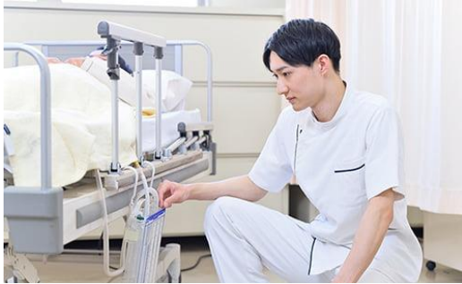
A “Keio Boy” also performs electrocardiogram (ECG) tests