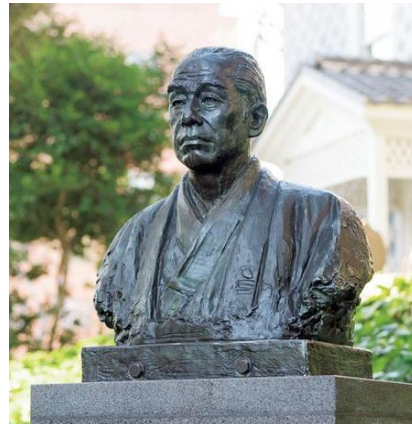
Bronze statue of Mr. Yukichi FUKUZAWA