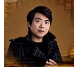
Pianist Lang Lang

In fact, teachers and graduates at private universities like Kindai University, Tokyo Women's Medical University, Kawasaki University, Jikei University, Nihon University, Nippon Medical School and Juntendo University often repeat phrases like “ Chatte, ” “ Chatte, ” “I m OK,” “Are you OK?” and exhibit a childlike, mediocre demeanor. During the Wiener Philharmoniker (Vienna Philharmonic Orchestra) concert at Suntory Hall on November 14, 2023, two female audiences who spoke out loud at the start of pianist Lang Lang's performance were admonished by other adults around them to be quiet, “ Shi~~ (Shh). ”