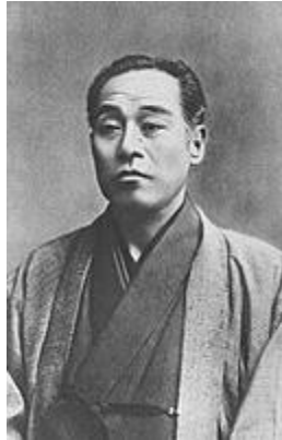
Mr. Yukichi FUKUZAWA