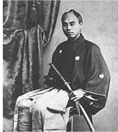
“White Supremacy (白人至上主義)”

A “Keio Nurse Boy” who works beside a patient receiving instructions from doctors and supporting them in their daily clinical work including changing diapers... , and graduates of private Keio University (Tokyo) see their image overlapped with that of the great Japanese figure, Mr. Yukichi FUKUZAWA (1835-1901).