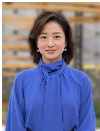
“Fun fun fun (Hmm hmm hmm)” TV wide show host Takako ZENBA