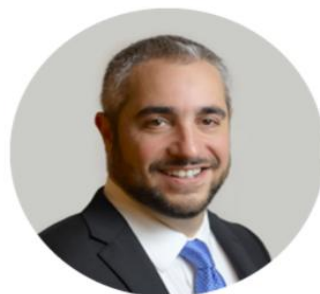
Representative Governor Jesse Green