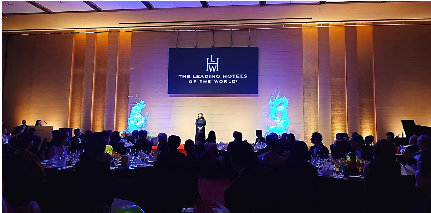
The Leading Hotels of the World 2026 Annual Gala Dinner (Dress Code: Black Tie) at The Okura Tokyo on February 14, 2026