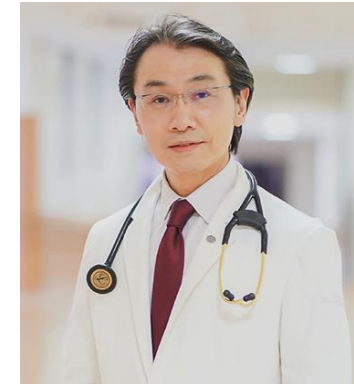
“His upper body leaned significantly”

“Three persons who, while possessing the intellect of a high-achiever (academic deviation score above 50), lack the innate talent of the elegant.”