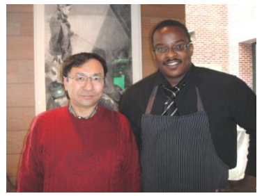
Head Bartender in 2010 Four Seasons Hotel Washington, D.C.