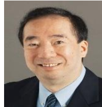
“The ‘Padding (Mizumashi) Business’ of the Yellow Boys and Yellow Cabs is not the royal road of business.” Dr. Seike