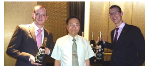
Brand Ambassador of Perrier-Jouët