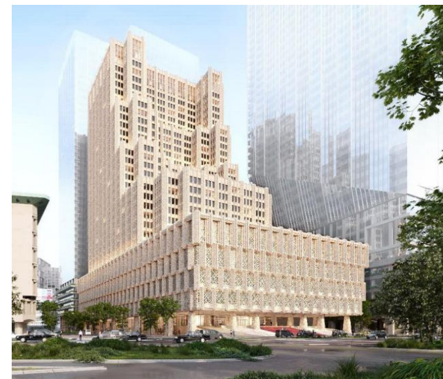
The Imperial Hotel Tokyo after its reconstruction in 2036