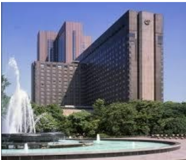
The Imperial Hotel Tokyo