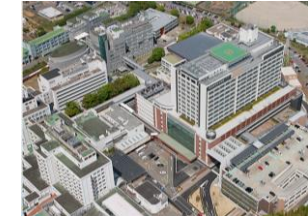
Aichi Medical University