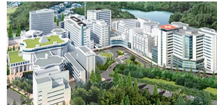
“Big money here ( Bakadakai, Koko. )” Fujita Health University