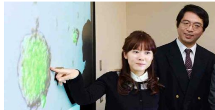
"Kawaii and Lady-killer" (?)