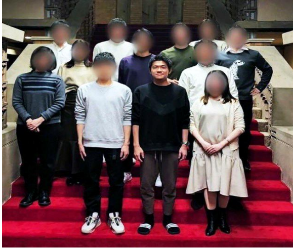
“L’Ultima Cena (Year-end Dinner Party)” in Tokyo “Betrayal to the Japanese people”