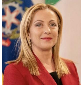
Italian Prime Minister Ms. Giorgia Meloni