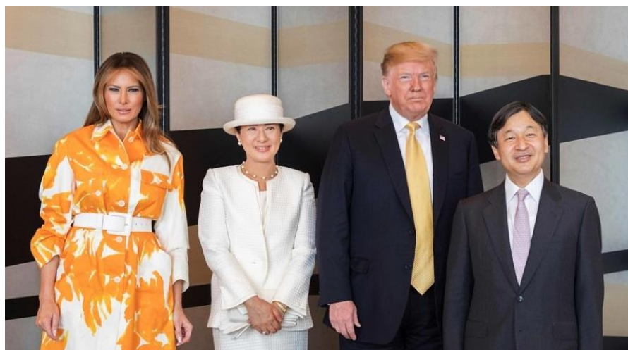
Their Majesties the Japanese Emperor Naruhito and Empress Masako, and U.S. President Donald Trump and First Lady Melania in the Palace Hotel Tokyo on May 28, 2019