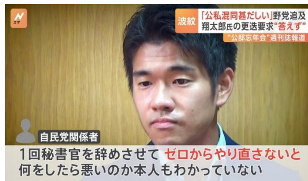
Japanese TV News on May 26, 2023