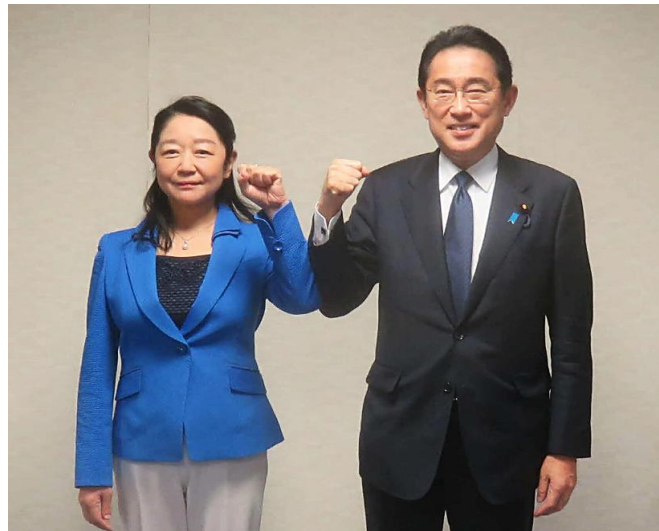
Japanese Diet Member Aki SHIRASAKA