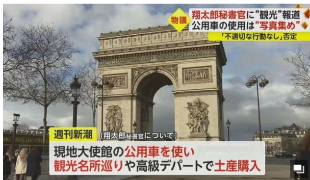
Japanese TV News on January 27, 2023