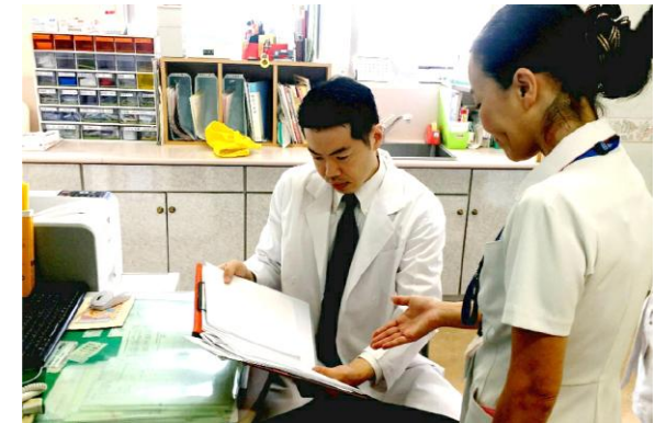
“Money-powered backdoor doctor”

Bachelor of Medicine of private Teikyo University (Famous money-powered backdoor University)