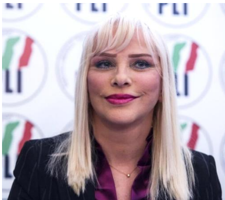
Former Italian Diet Member Staller Anna Ilona