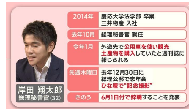
Japanese TV News on May 30, 2023 “Zero marks public business”

Japanese magazine Shukan Shincho reported that “Prime Minister’s Secretary Shotaro KISHIDA used vehicles from the Japanese Embassy in Paris for touring tourist spots and purchased souvenirs at high-end department stores.” Meanwhile, the government stated in a press conference aimed at the Japanese public that “the use of official vehicles was for collecting photographs, and there was no inappropriate action” (the use of official vehicles was necessary for gathering photos for information dissemination on official social media and other platforms during overseas trips, and there was no inappropriate action as the Prime Minister’s Secretary). [Ultimately, not a single photo (zero photo) of the tourist sites taken by Prime Minister’s Secretary Shotaro KISHIDA was posted on any official government social media platforms, and to this day, Mr. Shotaro KISHIDA personally owns them. And despite the use of taxpayer money, it has not been clarified whether photos of tourist sites intended for posting on the government’s social media actually exist.]