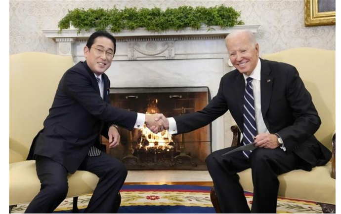
Prime Minister Kishida and President Biden in the White House