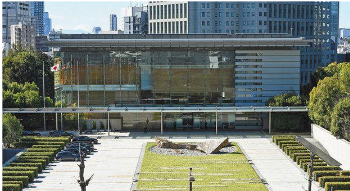
Japanese Prime Minister’s Office in Tokyo