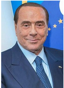
Former Italian Prime Minister Late Silvio Berlusconi