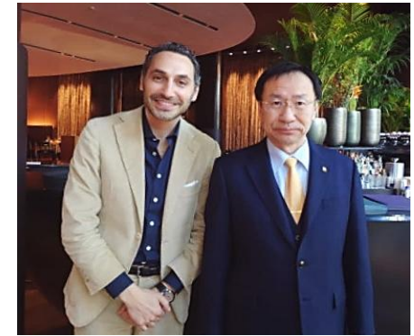
Cocktail “Chairperson” and Mr. Dell’Appennino Bulgari Hotel Milano