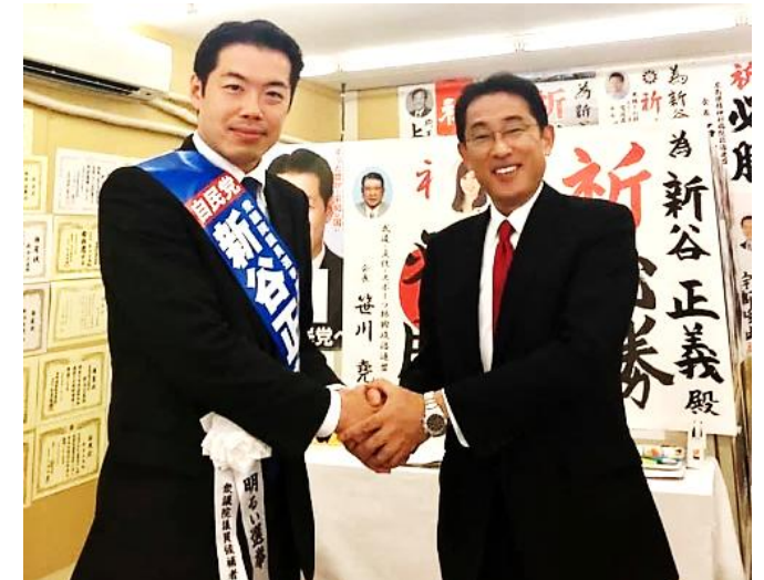
Japanese Diet Member Masayoshi SHINTANI

“Despite being a case of backdoor admission through monetary influence, he became a doctor with confidence, and later, with abundant financial resources of over 60 million yen, advanced to the Faculty of Economics at the national University of Tokyo.”