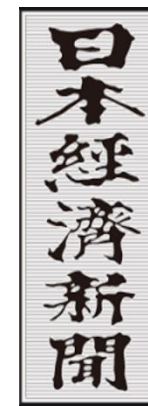
"Shallow thinking" 「お考えが浅い」