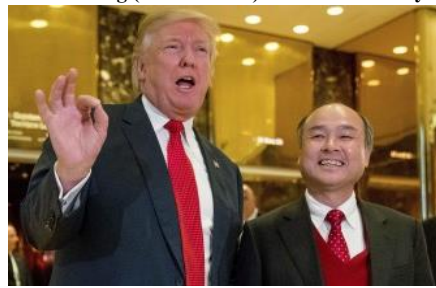
“Is Mr. Son hero or hypocrite?” President Trump and Chairperson & CEO Son