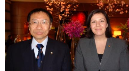
Director of Rooms Mandarin Oriental Boston