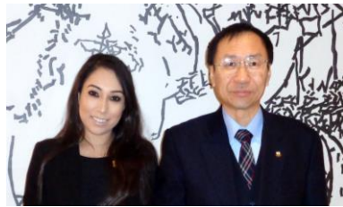
Assistant Manager of Front Office