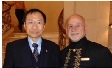
Head Bell Captain