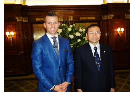
Front Office Manager