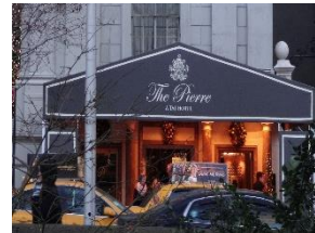
Restaurant Manager The Pierre Taj Hotel New York