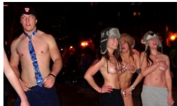
"Festival" Harvard University