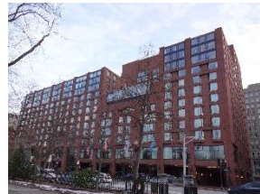
Hotel Manager Four Seasons Hotel Boston