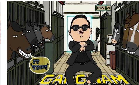
"Gangnam Style" PSY