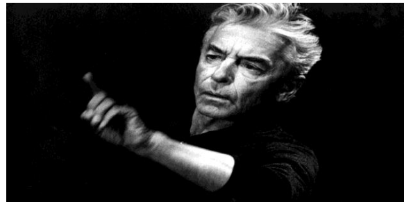
Mr. Herbert von Karajan (1908–1989)