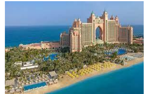
Atlantis Hotel The Palm, Dubai