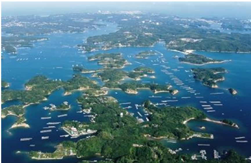
G7 Ise-Shima Summit was held here in 2016. Ise-Shima Resort in Mie Prefecture