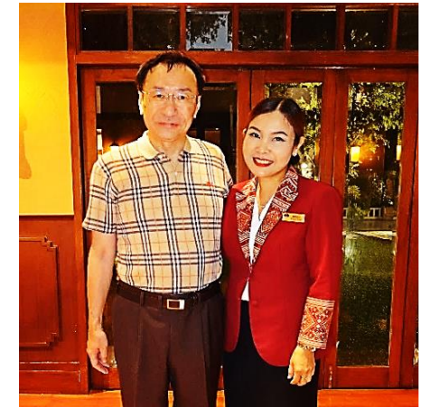
General Manager, Cocktail “Chairperson,” and Manager of the “Sala Rim Naam” show restaurant of the Mandarin Oriental Bangkok