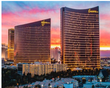
Wynn & Encore Hotel Las Vegas