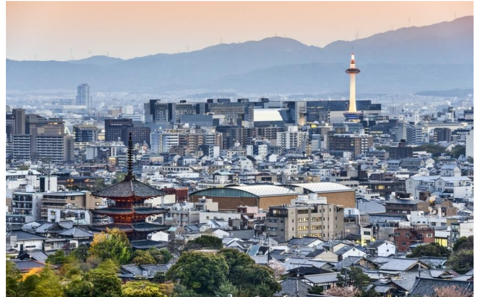
The black building slightly behind the center of the photo is the Kyoto Station. Kyoto City