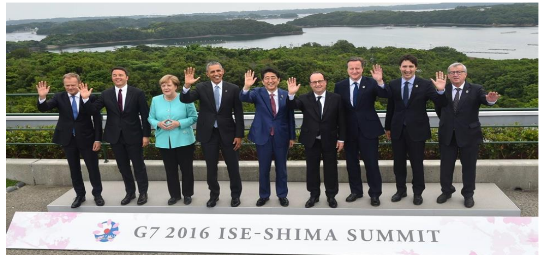
May 26, 2016