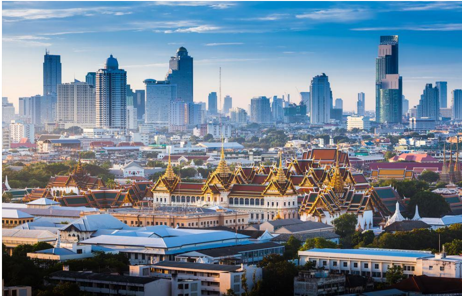
The palace is in the center of the photo. Bangkok