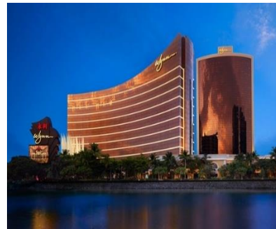
Wynn & Encore Hotel Macau