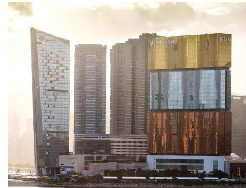
Mandarin Oriental (Left) and MGM Grand Hotel (Right) in Macau