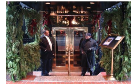
21 Club New York