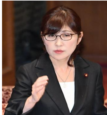
Lawyer Tomomi Inada