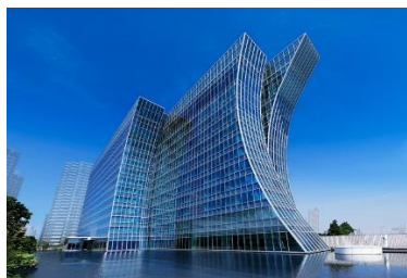
横浜 Baycourt Hotel & Kahara Hotel 横浜