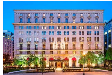
Yokohama Baycourt Club Hotel & Yokohama Kahara Hotel