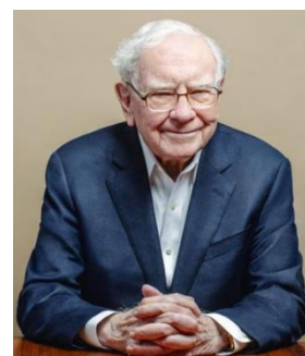
“The God of Stocks”

it turned out, however, the Nikkei Stock Average hit the first high in 31 years at 27,444 yen (266 US$) for a year-end closing price on December 30, 2020. Further, Mr. Warren BUFFET, who is referred to as “the god of stocks,” bought Japanese stocks worth 370 billion yen (3.59 billion US$, 3 companies’ stocks are high-yield of Japan’s big five general trading houses) on his 90th birthday on August 30, 2020, and I, a 58-year-old novice at stocks, switched stocks that were inherited from my uncle in 2020 to buy stocks amounting to 60 million yen (5.8 hundred thousand US$). Fortunately, both of our stocks remain stable, yielding a good return (a dividend yield of more than 3.0% in Japan).