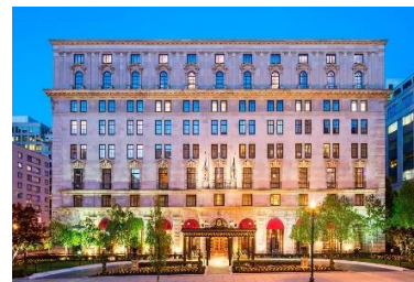
St. Regis Hotel Washington, D.C.