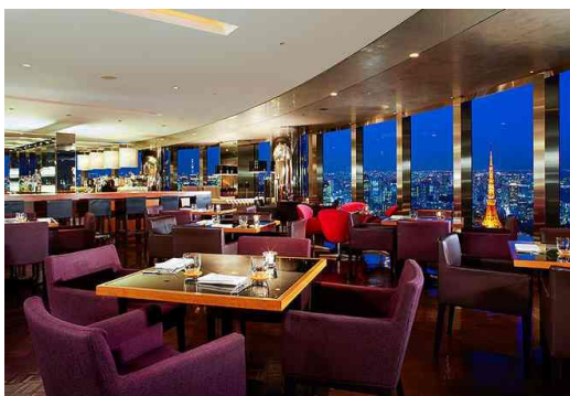
Bar Lounge Fifty-one