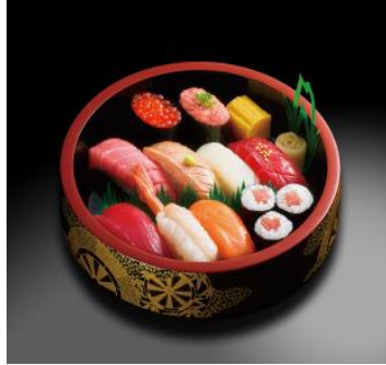
Delivery Sushi “Utage (Dinner Party)” Ginno-sara

Bachelor of Laws from private Keio University