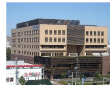
Nagoya District Court

On the other hand, in Japan, there is currently an ongoing trial at the Nagoya District Court (Aichi Prefecture, Japan) concerning the death of a Sri Lankan woman who was detained at the Nagoya Regional Immigration Services Bureau for illegal stay and died in March 2021 after complaining of health problems and not receiving necessary medical care. The surveillance footage reportedly includes the laughter of the guards, showing immigration officers (public servants) surrounding the weakening foreign woman, sometimes smirking and becoming bystanders without offering help. This response has been criticized both domestically and internationally. The bereaved family expressed their anger, saying, “My sister was treated like an animal and killed. There was no humane treatment at all. All foreigners (non-Japanese) should see this.” A professor at the national University in Tokyo commented, “If this is not a murder with indirect intent, it is likely professional negligence resulting in death. It is an irreparable act not only to the person herself but also to her family. Both the on-site staff and the top officials cannot escape with only minor penalties.”