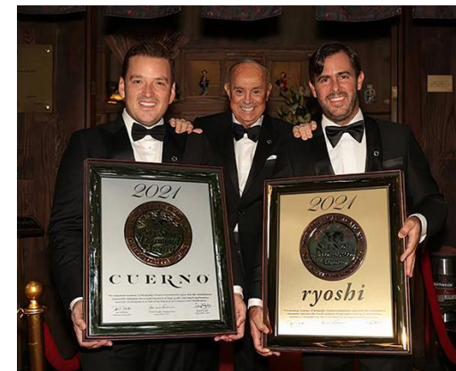
Restaurant Ryoshi Group has received the Six Star Diamond Award in 2021