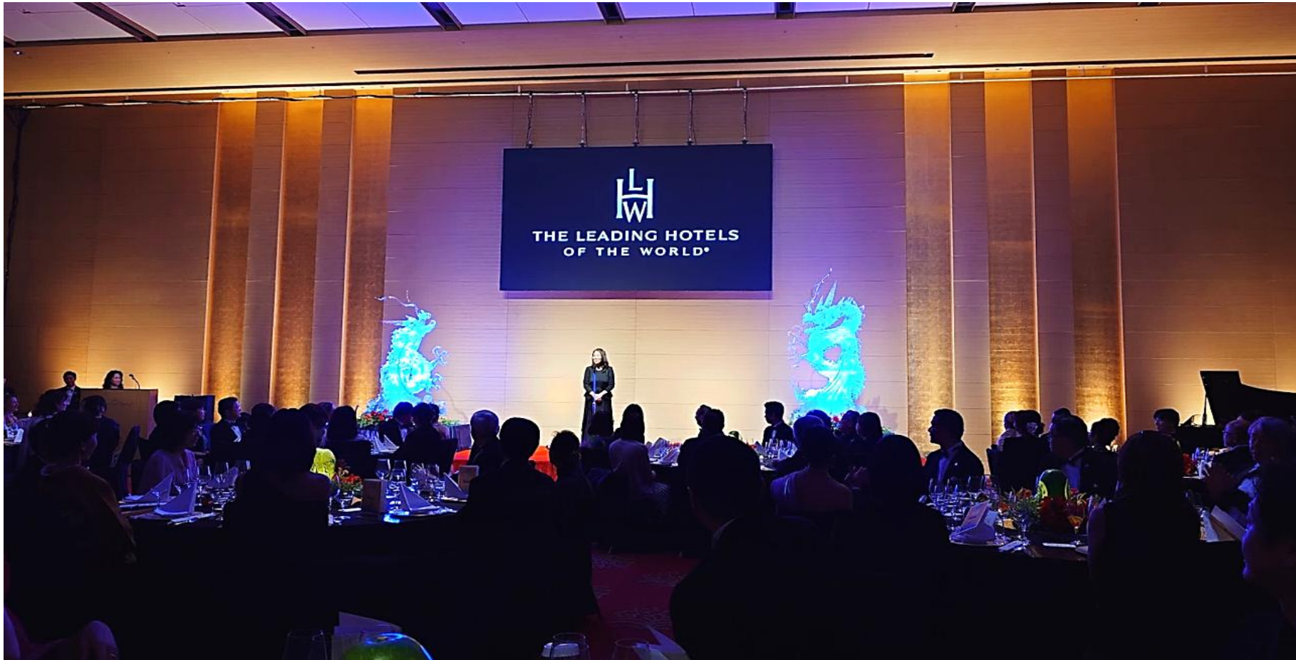
The Leading Hotels of the World 2026 Annual Gala Dinner (Dress Code: Black Tie) at The Okura Tokyo on February 14, 2026