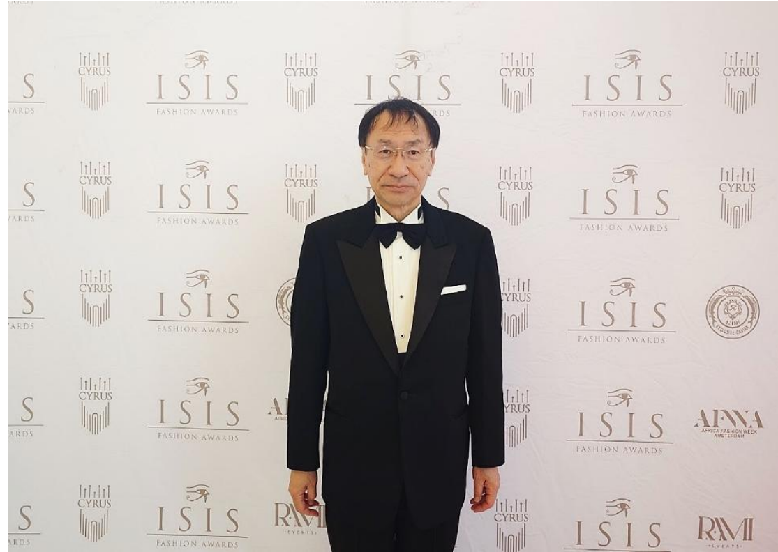
ISIS Fashion Award in Amsterdam on May 6, 2026