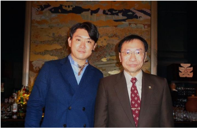
"2015 World Class world champion"

Nagano (2009), Nagoya (2009, 2010, 2011, 2019), Kobe (2009, 2010, 2011, 2012, 2019), Osaka (2009, 2010, 2011, 2012, 2019), Kyoto (2009, 2011, 2012, 2019), Sapporo (2009, 2020), Numazu (2010), Utsunomiya (2010, 2019), Niigata (2010), Sendai (2011, 2019), Fukuoka (2011, 2020), Kanazawa (2011, 2020), Oita (2012), Kurashiki (2019), Okayama (2019), Koriyama (2019), Fukushima (2019), Naha (2020), Tokushima (2020), Nanao (2020), Kashikojima (2021), Toba (2021), Tsu (2021), Shizuoka (2021), Hamamatsu (2021), Yokohama (2021), Tokyo (2021), Urayasu (2021), Chiba (2021), Urawa (2021), Omiya (2021)