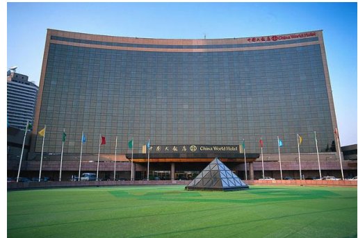
China World Hotel Beijing