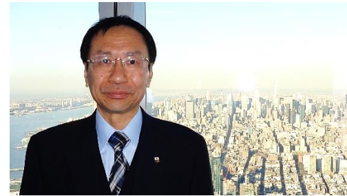
“Brilliant ( Shuusai ), still not Professor”