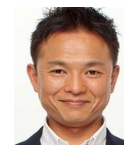
“Mediocrity ( Bonsai )”