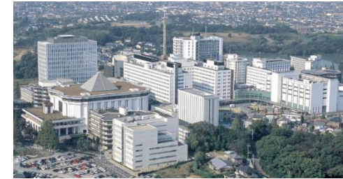
“ Soko, Sekaichi ” (?) “World’s No.1. Bottom (70 million yen) ” (?)