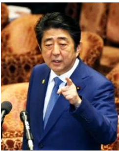
“Mediocrity ( Bonsai )”

The reason is that in Japanese private universities, such as Nihon University, Kindai University (former Kinki University) and Fukuoka University... people are mediocrities and it is difficult for them to understand the theory. Most of them are at the Intellectual level (IQ, Deviation scores...) where they don’t have the custom of reading Time or Newsweek magazines and are not confident in their academic records. Prime Minister Shinzo Abe was also not smart enough to be admitted into the Fukushima University (national university)