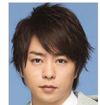
“ Mediocrity (Bonsai) ” Mr. Sakurai

Sho Sakurai, a Japanese famous talent who has played doctor role, is mediocrity whose deviation score ranges from 40 to 49. However, he uses an entrance exam broker and are judged by a private university that he or his family can afford to 60 million yen or more in medical education fees, there is a good possibility that they would be admitted from the backdoor and become a money-powered doctor. As for the national examination for medical practitioners that they sit for after graduating from medical schools, as a result of its having become easier in the 21st century, if they take it, they will pass it in actuality. If you pay about 60 million yen, you will then pass it without problem. Given that annual incomes for nurses and clinical laboratory technicians whose range of medical act are about a less than 5 million yen (375,00 US$) and those of doctors who have a medical license (that allows them to conduct the entire scope of medical act) are about a more than 15 million yen (1,130,000 US$), their tuitions of 60 to 70 million yen that they or their parents paid by working their head off will be recovered in no more than 10 years.