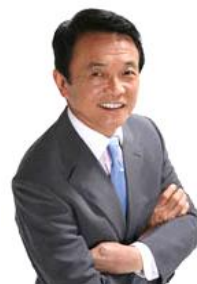
“Mediocrity ( Bonsai )”

Aichi Medical University (private university) or Fujita Health University (private Nanzan School of Law (private school) or Aichi Law School (private school) in enter the school (a graduate school) as your final closed because no students of the school could However, a Japanese novelist assured that Mr. he enters a safety university and law school, then talent who played the role of lawyer in a TV below 50 in Japan. There is thus no problem to million yen.