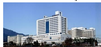
Tokai University Hospital (804 Beds)