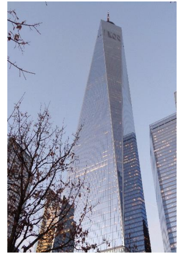
One World Trade Center

# Why hasn’t the Doping-Backdoor Theory been understood?